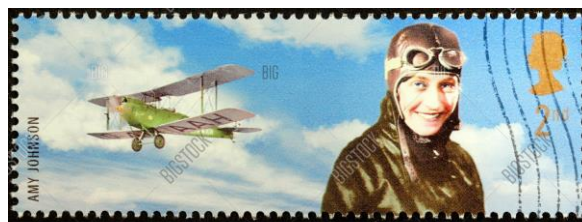
Amy Johnson – ATA Volunteer